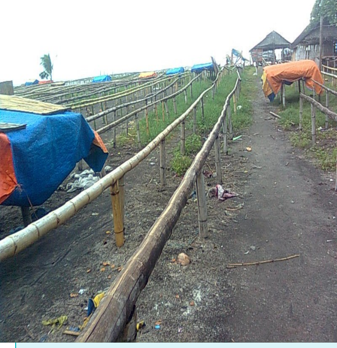
Paper presented during the 9<sup>th</sup> AFAF, April 21-25, 2011, Shanghai, China