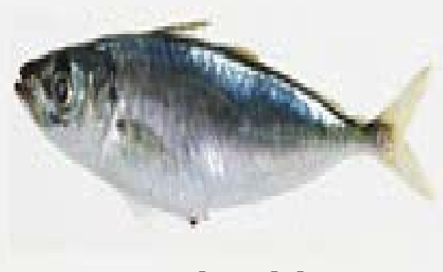
Malatindok (Japanese scad)