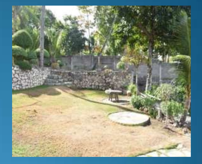
Figure 2. Beach Resorts of the Northern Cebu, Philippines