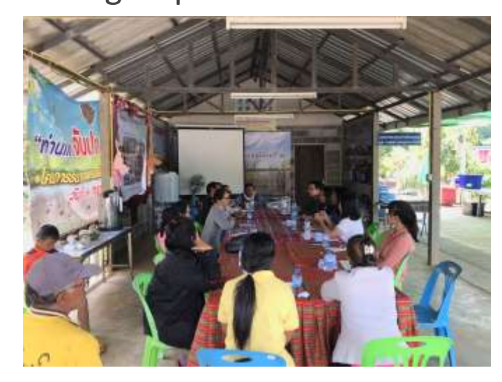
Sub Somboon Aquatic Animal Food Bank for inland fisheries

To understand the roles and background of women leaders in successful fisheries and aquaculture management groups