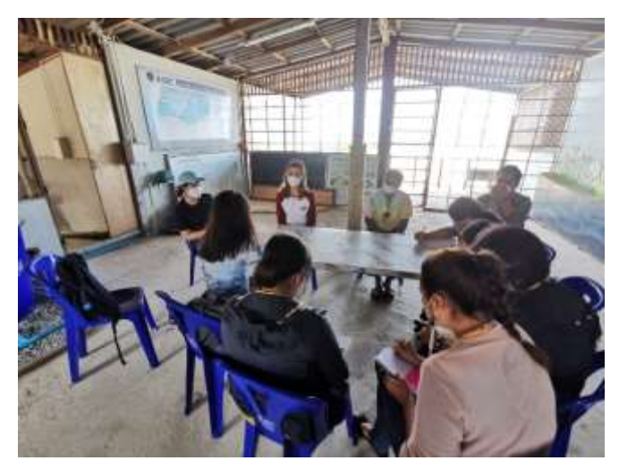
Kayoed Small scale Fisher's Group for coastal fishing

The study was conducted in 2020–2021 through the focus group discussion with the officers and members of the fisheries management groups